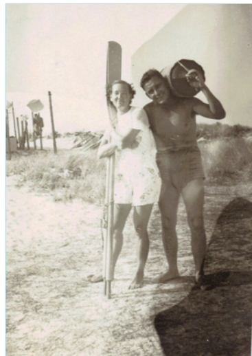
Mom and Dad bringing in water on shoulder