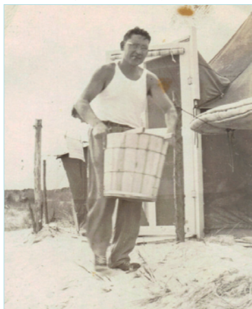
Dad bringing in basket of crabs