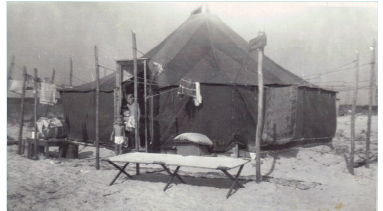
A tent in tent city with a cot outside

Once the building of motels began along the beachfront in Wildwood Crest, it was no longer permitted to set up tents and the Tent City was no longer. Ray enjoys speaking of the years spent in the summers at Tent City, and reliving "those wonderful times."