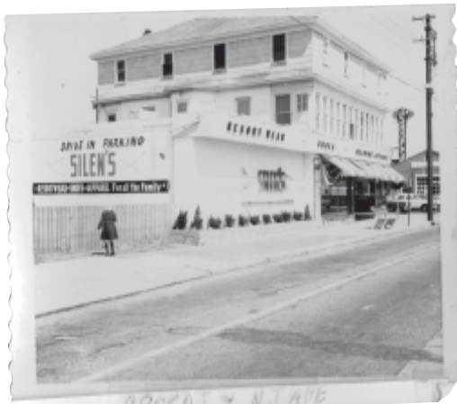
Silen's, still a Wildwood staple