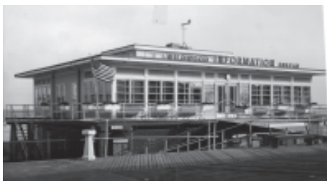
Boardwalk information center