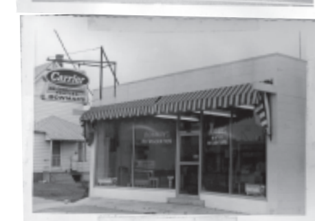
The storefront as it appears today

Photos from the Bowman Collection include many of the places on the island that the Bowman's installed air conditioning in for the very first time