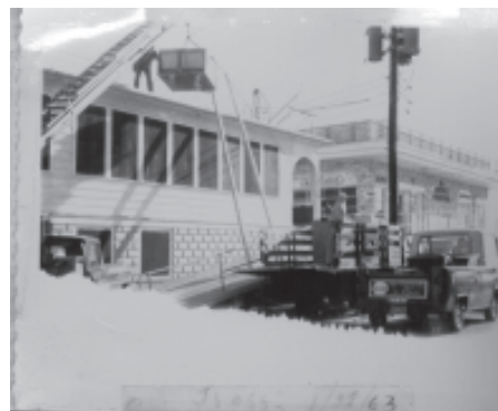
Groff's, 86 years on the Wildwood boardwalk.

Photos from the Bowman Collection include many of the places on the island that the Bowman's installed air conditioning in for the very first time