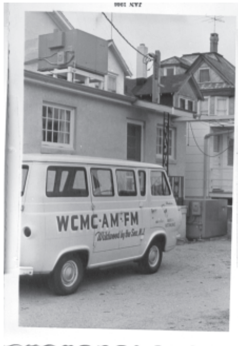
WCMC~ you can still tune in 1230AM ... listen to the voice of Jim MacMillan