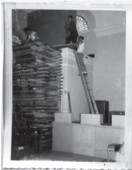
inside Marine Bank