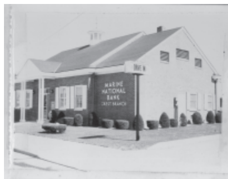
Marine National Bank