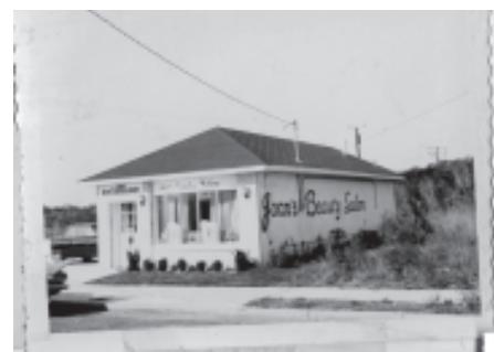
Joan's Beauty The building is still there at Preston & NJ across from Suncrest Market