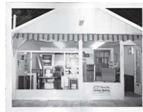
Above & below are photos of the original storefront before the Storm of 1962