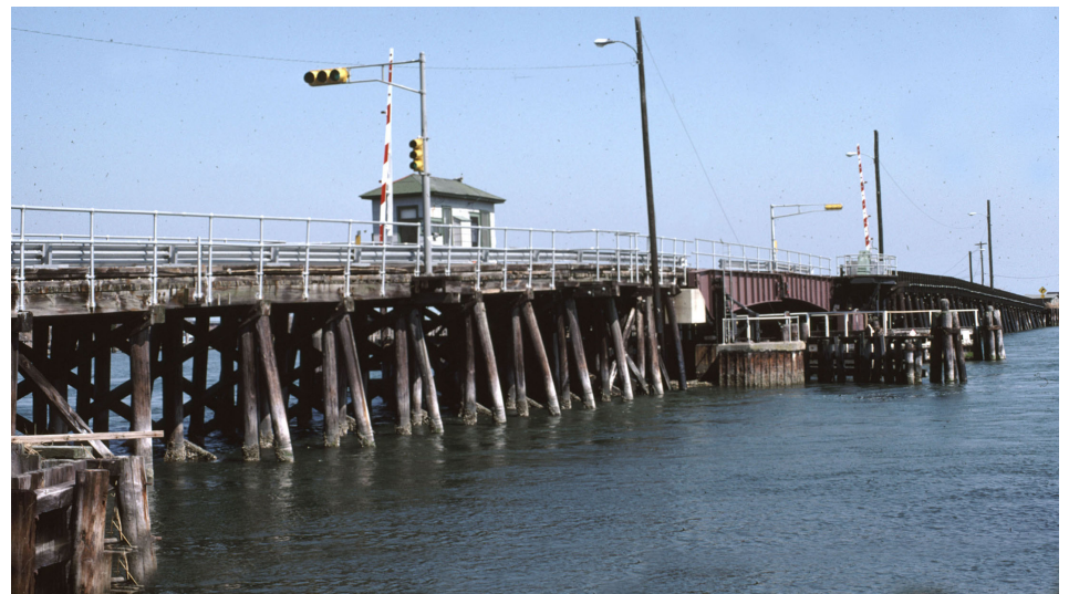
This old bridge was taken down in 1992 and replaced with a new and much higher one

My family moved to North Wildwood in 1942. We traveled so many trips over that bridge and even then it seemed very old. I often wondered how much life had traveled over it back and forth off the island."