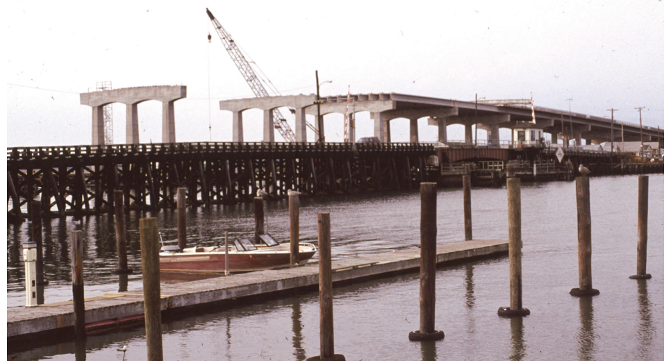
Road and bridge construction on North Wildwood Blvd. began in the late 1980s