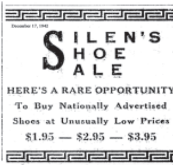
Silen's ads from 1942 and 1954