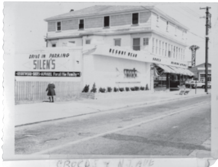
Silen's, c. 1960