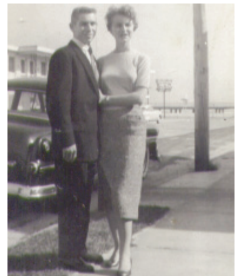
Picking up his date at her home on E. Hand Ave.