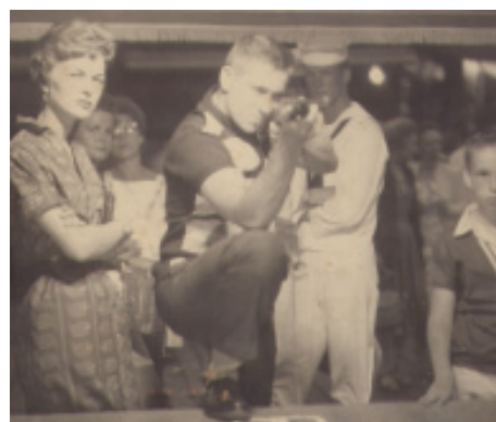
A regular boardwalk stop for the Forbes